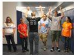
Class T-Shirt Day