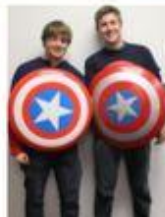
Super Hero Day